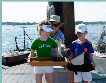
Public Sails Begin May 28th, 2021