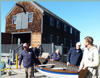
Annual Meeting May 12, 2021