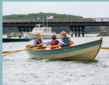
Round Island Regatta August 7, 2021